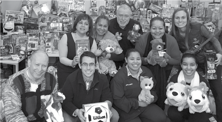
Hands to Help staff and volunteers prepare to distribute toys donated by Merrimack faculty, staff and alumni to children in Lawrence.