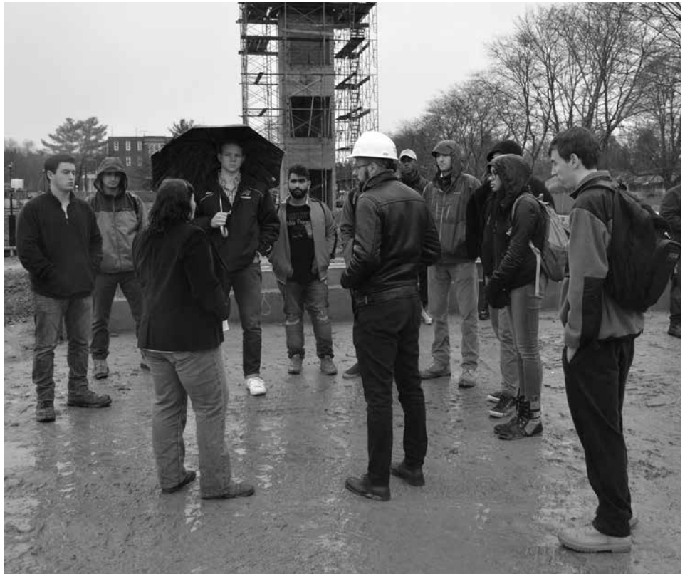
Engineering students tour the construction site at the North Campus Academic Pavilion, future home to the Girard School of Business.