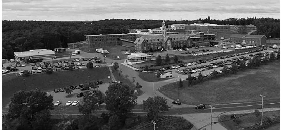
The Essex County Correctional Facility, in Middleton, Massachusetts.