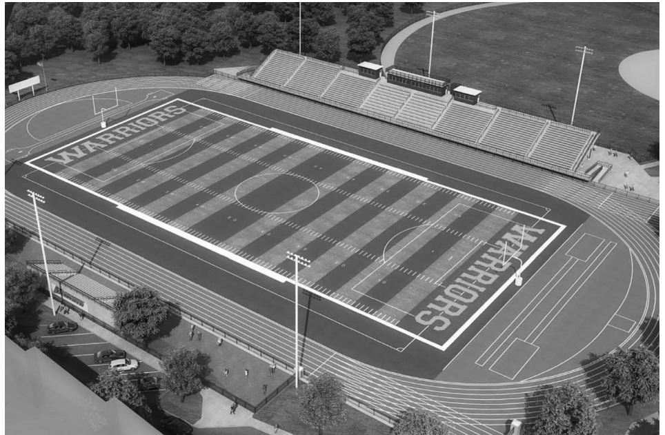
Architect's rendering of new 2,500-seat stadium and eight-lane track in the athletic district.

Hopey noted that when students return in the fall, several departments across campus will be relocated to new,